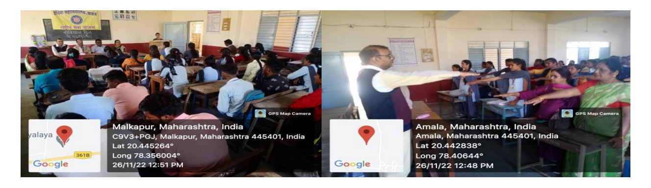
Participants Understanding Constitutional Values and Fundamental Duties